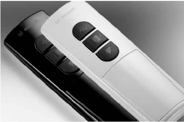
1-channel handheld transmitter to control radio controlled drives and radio receiver