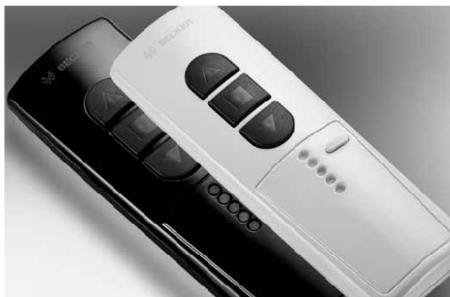
5-channel handheld transmitter for radio-controlled drives and radio receivers (individual, group and central control)